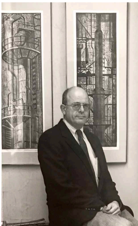
Fig. 2. The author as chair of the Yale Chemical Engineering department, ca. 1984