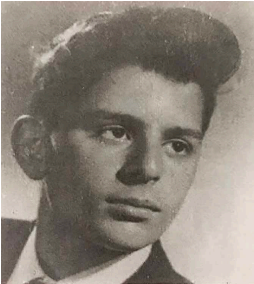
Fig. 1. HSM&A graduation photo, from January 1951 senior yearbook

which I created ca. 3x3-inch original linoleum cuts to illustrate feature articles. I also was elected co-art editor of our senior yearbook (which contained my official graduation photo, fig. 1), and I was ultimately awarded the Saint-Gaudens Medal for art upon graduating with the Phi Beta Kappa Alumni Award from HSM&A in January of 1951. It was a great experience for me to be immersed in such a student body in a very special public high school with a rigorous academic program. It is true that I didn't have some "technical" subjects (including calculus!) that students from, say, Bronx High School of Science or Brooklyn Tech might have elected, but I did have a memorable physics course. I made up for these gaps when I moved on to the college level.