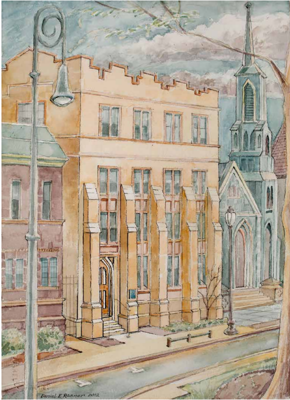
Fig. 4. Mason Laboratory (9 Hillhouse Avenue)

because I thought my former Ph.D. students and postdocs, now dispersed around the globe, might appreciate such a personalized memento. That picture was such a hit that I embarked on a series of paintings of iconic Yale buildings, now totaling about nineteen, with a recent one, Strathcona Hall via Grove Street looking west, completed in 2017; and Bass Tower, completed in 2018. 1 By now Susan would like me to “give it a rest” (i.e., turn to other subjects). However, Merwin’s Art Shop (on Chapel Street) demonstrates that there is a steady market for inexpensive matted reproductions of these paintings among visiting parents and Yale alumni (fig. 5). I am also hopeful that organizations like the Yale Alumni Association, which expressed an interest in these images during my 2016 show at the New Haven Lawn Club, will ultimately use some of them in their future literature and correspondence.